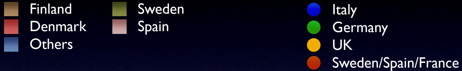
M2M subscription in % of the total MS